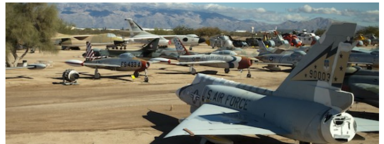
Pima Air and Space Museum

Located on the Tohono O'odham San Xavier Indian Reservation, is this small, but stunning white mission church. It was completed in 1797 and is still an active place of worship today. Learn More.