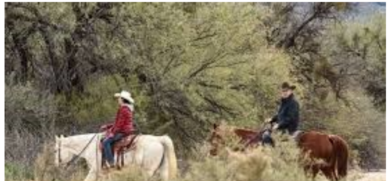
Houston's Horseback Riding

While waking up at 4 in the morning might not sound appealing, once you're sky-high above the Arizona desert with the sun on your face, you'll quickly realize it was more than worth it. Book Now.