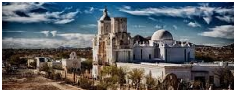
San Xavier Del Bac Mission

Located on the site of the historic Porter property, Tucson Botanical Gardens (TBG) is a five and a half acre collection of 20 gardens in the heart of Tucson, AZ. Learn More.