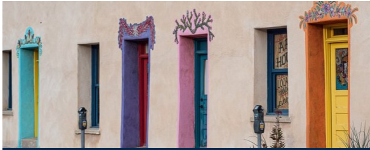
Tucson Origins Walking Tour

Discover why Tucson is one of the most important cities in the American Southwest on this cultural heritage walking tour. Book a Tour.