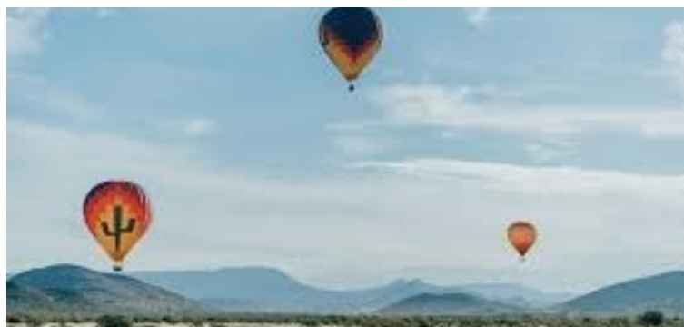
Tucson Balloon Rides

One of the largest aerospace museums in the world, the phenomenal Pima Air and Space Museum lies just 15 minutes' drive to the southeast of the city. Learn More.