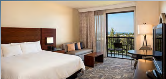
Palace Tower Room

Availability of amenities is subject to change, due to circumstances surrounding the COVID-19 pandemic.